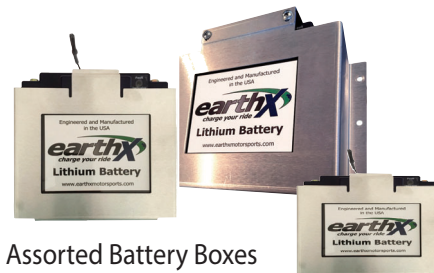
Assorted Battery Boxes