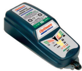
OptiMate Lithium Battery Chargers